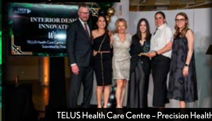
TELUS Health Care Centre – Precision Health