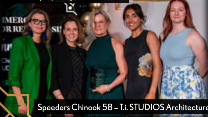
Speeders Chinook 58 – T.i. STUDIOS Architecture