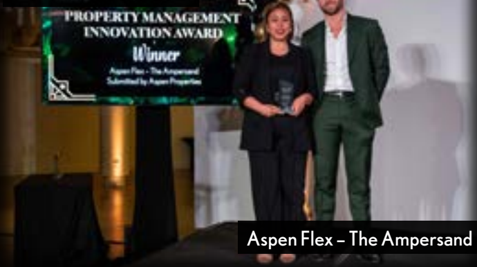
Aspen Flex – The Ampersand