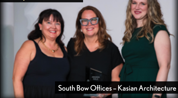
South Bow Offices – Kasian Architecture