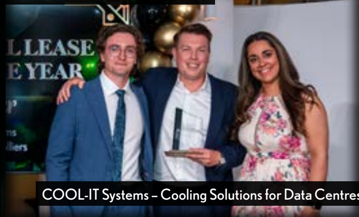
COOL-IT Systems – Cooling Solutions for Data Centres